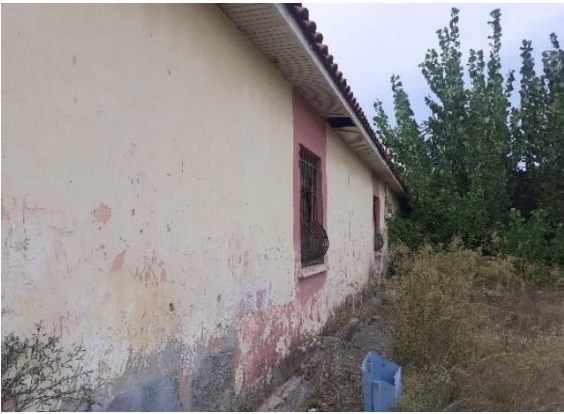
Existing "Isuf Ferra" Kindergarten pictures