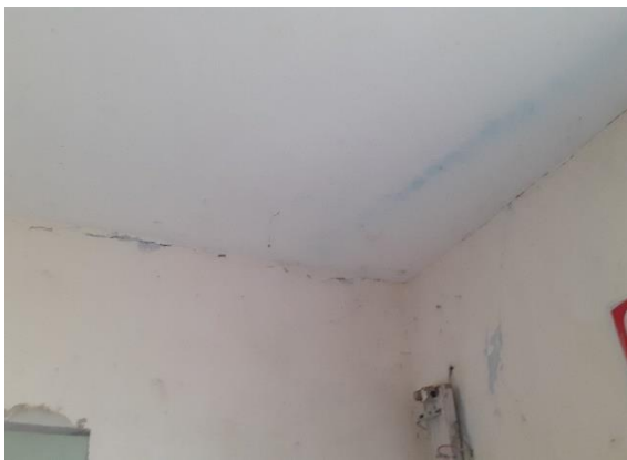
Existing "Jusuf Hoti" Joint School pictures