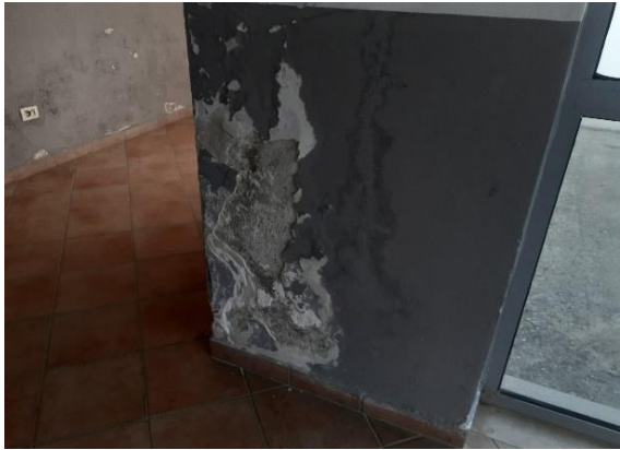
Existing "Zyber Sallaku" 9 – year School pictures